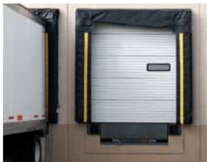
Vision Lites allow for visibility while maintaining security