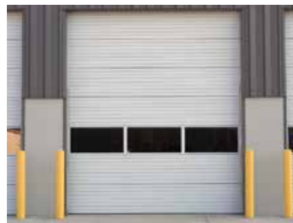
Aluminum full view sections allow for maximum natural light and visibility