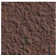
Brown Embossed Stucco Finish